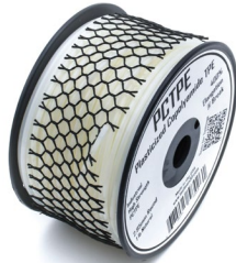
[ Taulman ] PCTPE Natural | Translucent