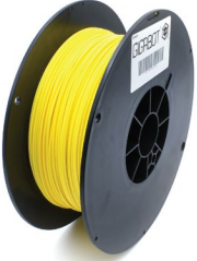
PLA Black White Silver Natural | Translucent Yellow Red