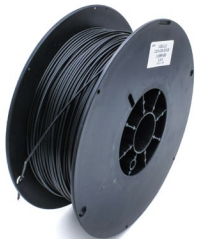
ABS Black White