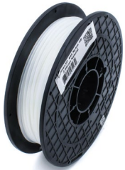
[ Taulman ] Nylon 645 Natural | Translucent