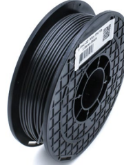
[ Taulman ] Alloy 910 Black Natural | Translucent