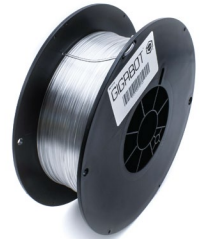
PET-G Natural | Translucent