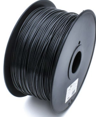
Polycarbonate Black White