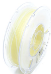
Support Material PVA Polysupport