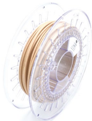
Woodfill Light Brown