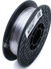
[ Taulman ] T-Glase Black Translucent