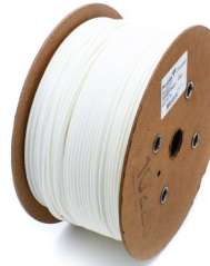
[ Ninja Tek ] Cheetah Black White