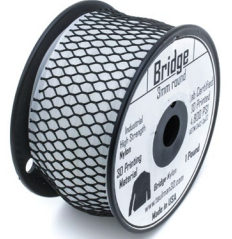
[ Taulman ] Nylon Bridge Natural | Translucent