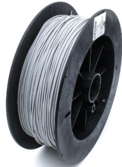
[ Ninja Tek ] Ninja Flex Silver